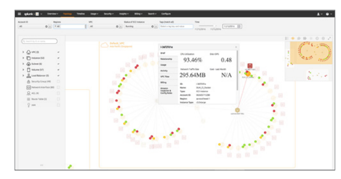
Figure 2: Splunk App for AWS Topology Dashboard

Splunk Insights for AWS Cloud Monitoring provides teams with end-to-end visibility into their AWS infrastructure from the critical point of workload migration to long after their deployment on AWS. The AMI (Amazon Machine Image) can be deployed via AWS Marketplace and can correlate hybrid environments to remove blind spots from your cloud journey.