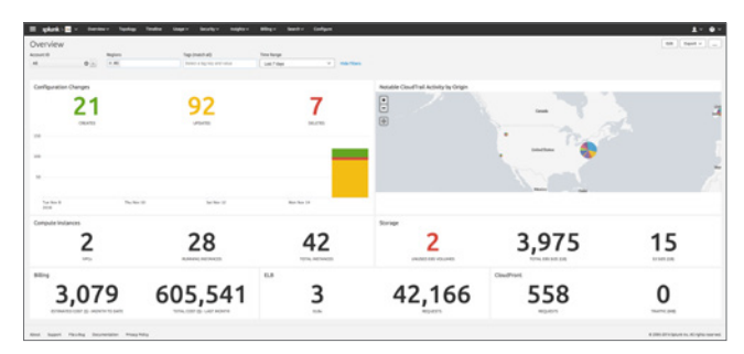
Figure 1: Splunk App for AWS Overview Dashboard

The Splunk App for AWS is available on Splunk Enterprise, Splunk Cloud and on Splunk Insights for AWS Cloud Monitoring in AWS Marketplace.