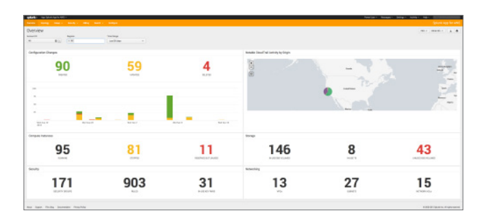
Figure 1: Splunk App for AWS Overview Dashboard