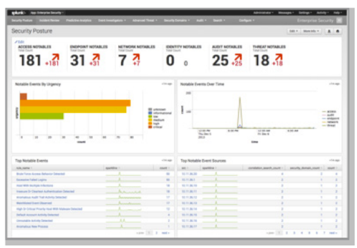
Splunk Professional Services help you quickly deploy best in class SIEM implementations for your security needs.

The duration of the engagement varies based on the size of your environment, however, the average timeframe is four to six weeks.